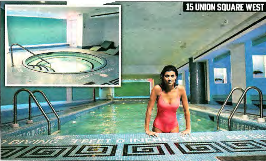
15 UNION SQUARE WEST